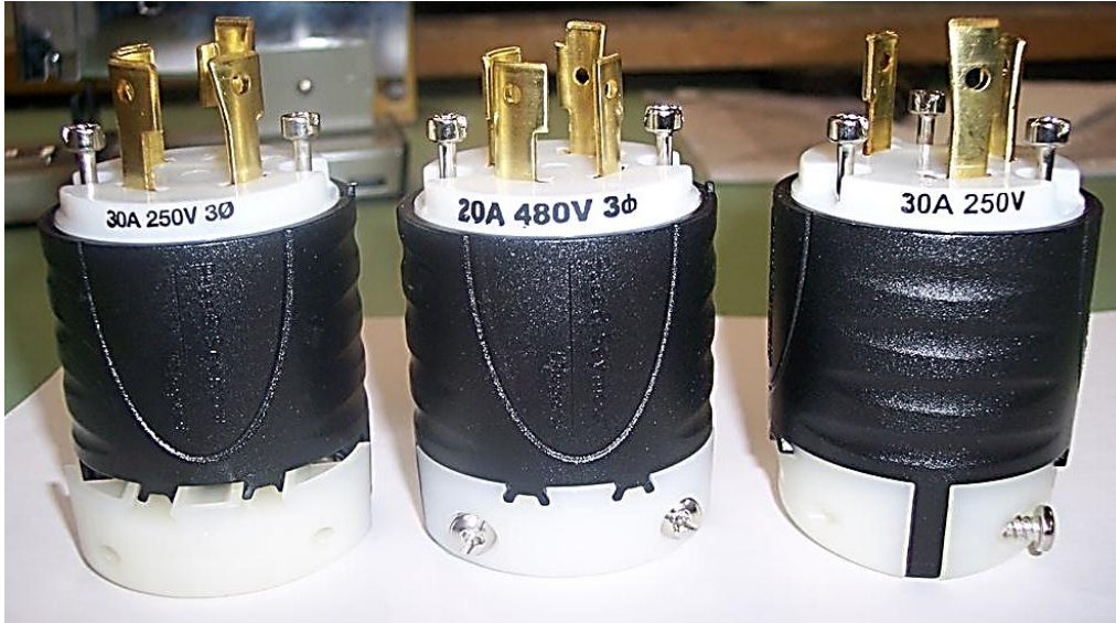
Figure 5 – Electrical Quick Disconnect Plugs (Male)