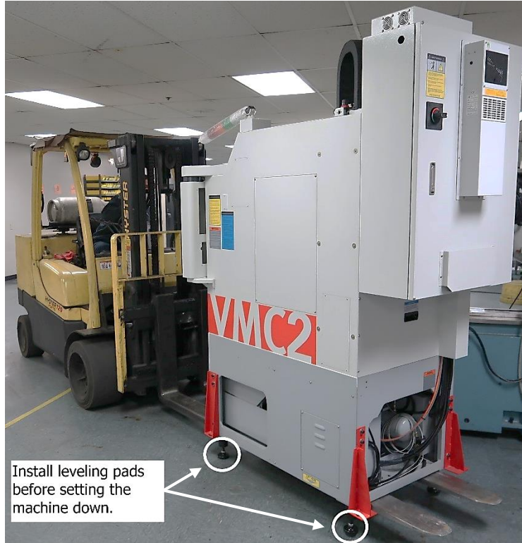
Figure 3 – Installing Leveling Pads