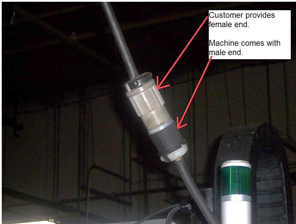
Figure 6 – Power Cable Example