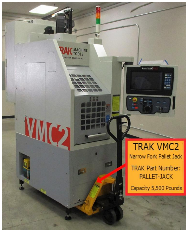
Figure 4 – Moving with Pallet Jack