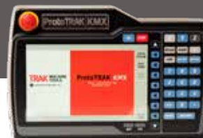
ProtoTRAK KMX Control