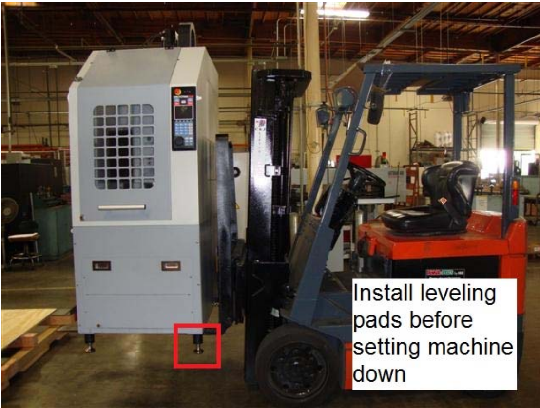
Figure 3 – Installing Leveling Pads