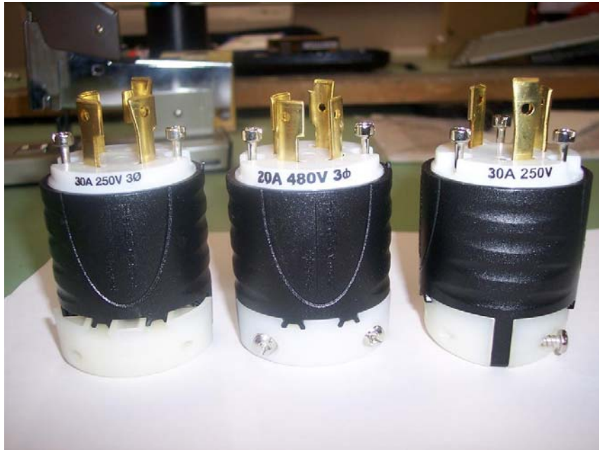
Figure 5 – Electrical Quick Disconnect Plugs (Male)