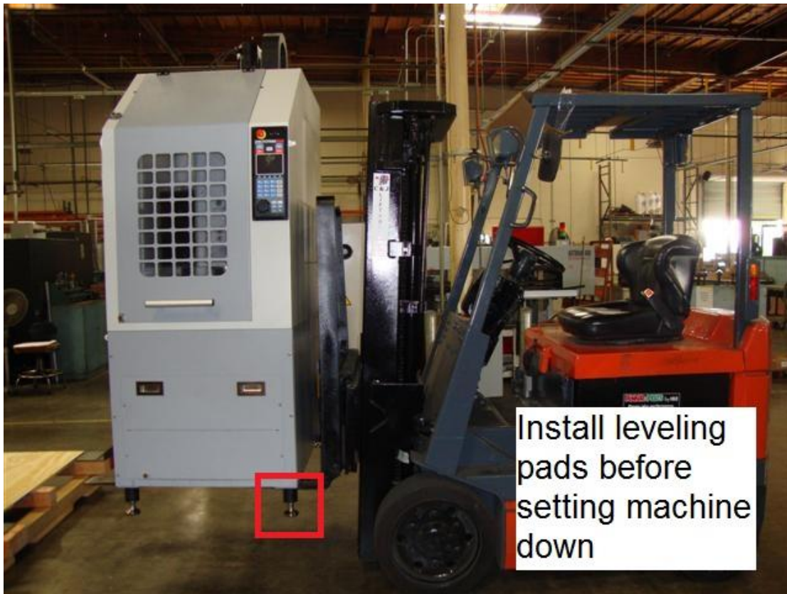
Figure 3 – Installing Leveling Pads