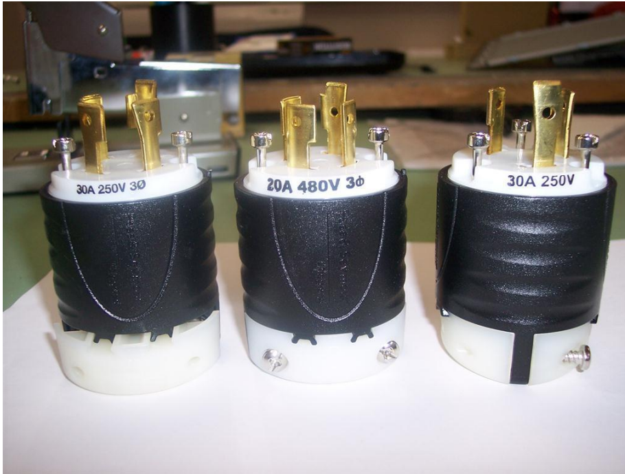
Figure 5 – Electrical Quick Disconnect Plugs (Male)