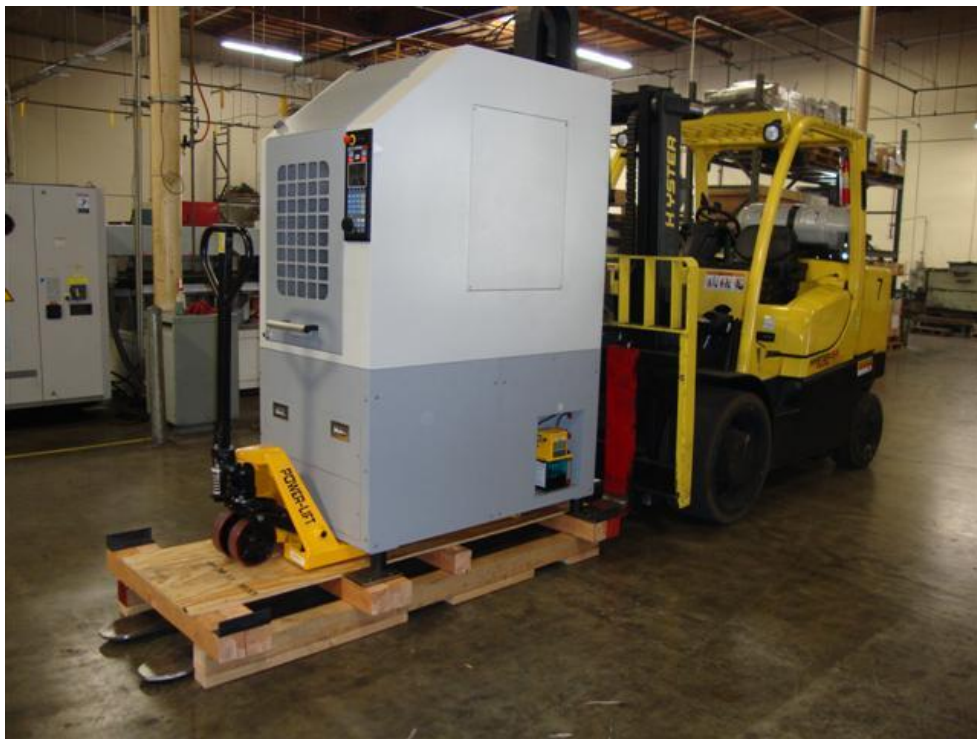
Figure 2 – Lifting the 2 OP