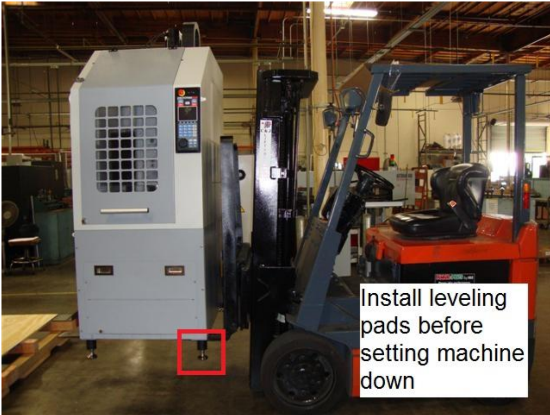
Figure 3 – Installing Leveling Pads