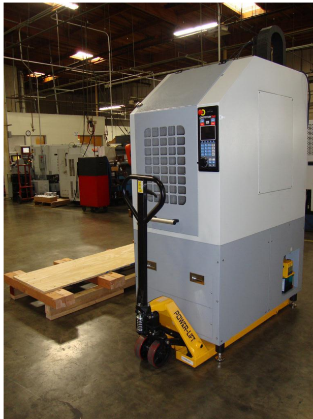
Figure 4 – Moving with Pallet Jack