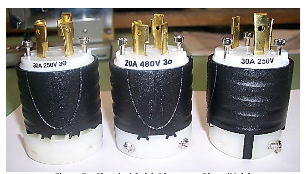
Figure 5 – Electrical Quick Disconnect Plugs (Male)