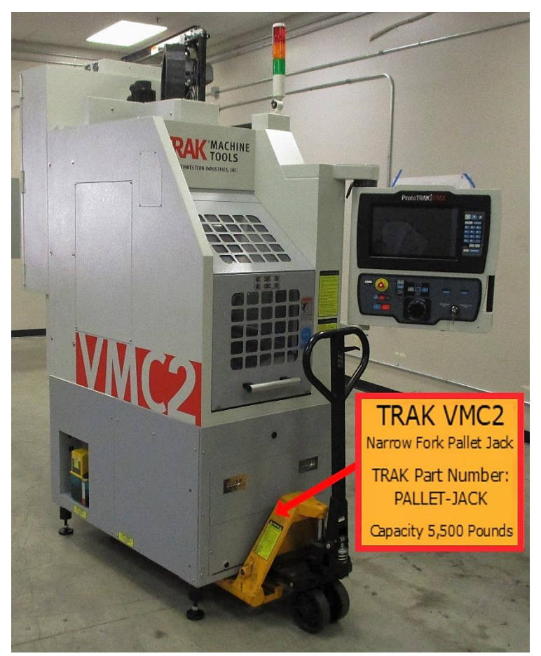
Figure 4 - Moving with Pallet Jack