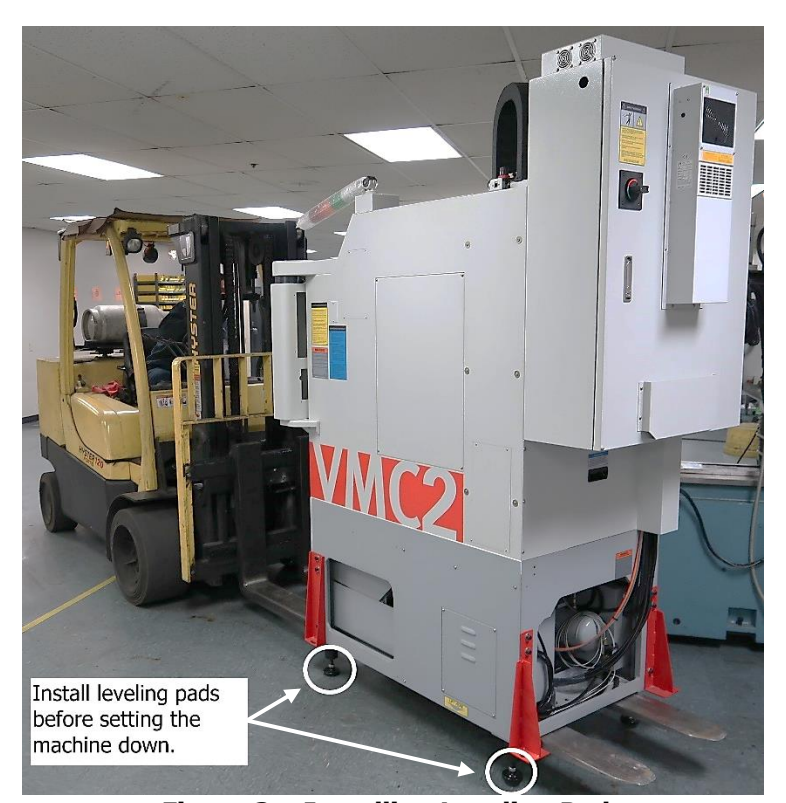
Figure 3 – Installing Leveling Pads