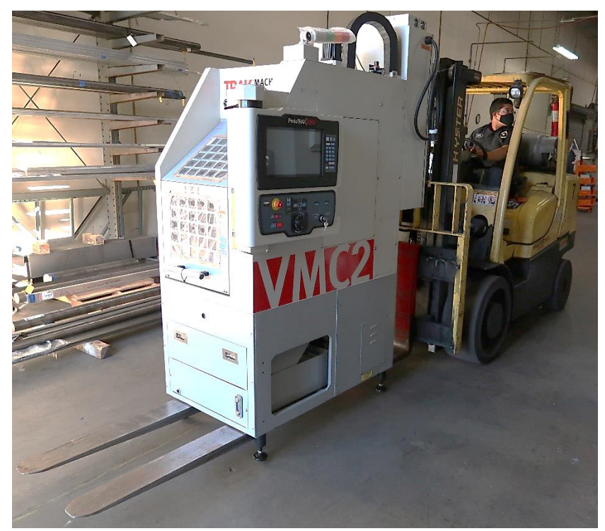
Figure 2 – Lifting the VMC2