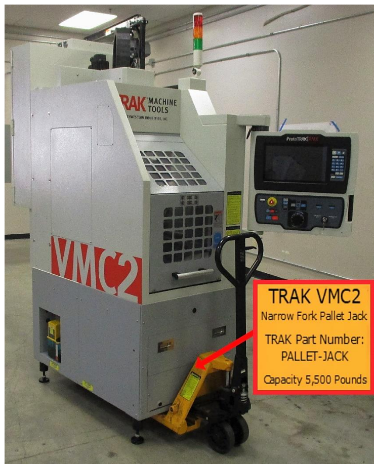
Figure 4 – Moving with Pallet Jack