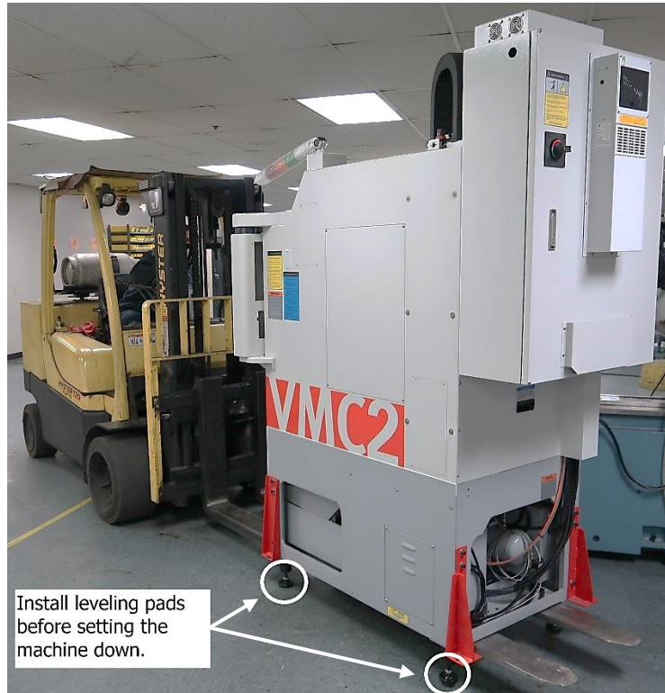
Figure 3 – Installing Leveling Pads