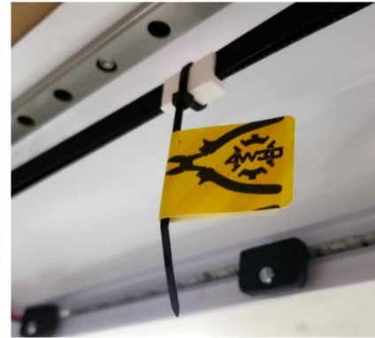
Zip Tie and White Clip (Right Belt)

NOTE – When removing the zip ties, be careful not to cut the left and/or right belts, as well as any internal cords within the 3D Printer. Doing so will cause damage to the printer.