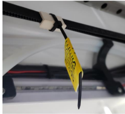
Zip Tie and White Clip (Left Belt)