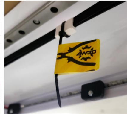
Zip Tie and White Clip (Right Belt)

NOTE – When removing the zip ties, be careful not to cut the left and/or right belts, as well as any internal cords within the 3D Printer. Doing so will cause damage to the printer.