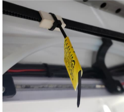
Zip Tie and White Clip (Left Belt)