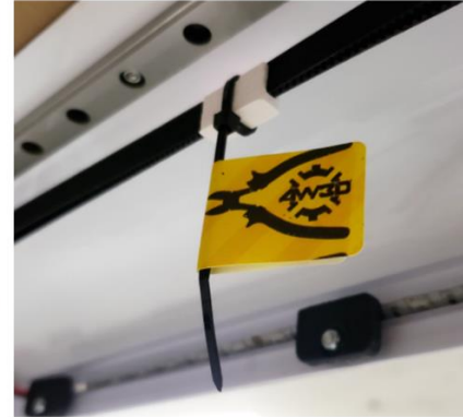
Zip Tie and White Clip (Right Belt)

NOTE – When removing the zip ties, be careful not to cut the left and/or right belts, as well as any internal cords within the 3D Printer. Doing so will cause damage to the printer.