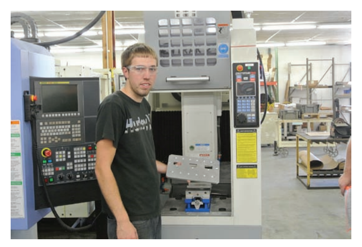
Sample part machined by a TRAK 2<sup>OP</sup> and Doosan Machining Center

Damark Manufacturing calls the concept of placing a TRAK 2<sup>OP</sup> second operation machine next to a primary ma-