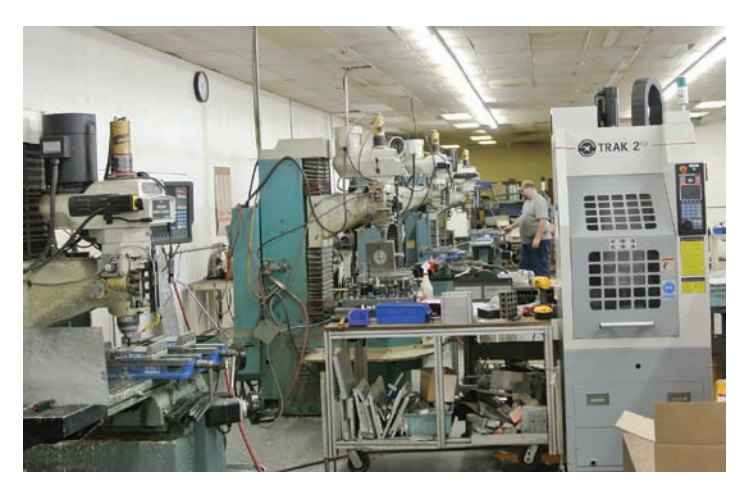
TRAK 2<sup>OP</sup> placed next to CNC mills for simultaneous machining of two different parts.

The TRAK 2^{OP} work table incorporates a built-in Jergens ball lock system that reduces changeover times. "Given our expertise, we will be able to design and build soft jaw/hard stop fixtures to make changeovers even more efficient," said