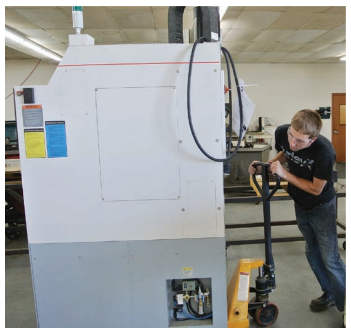
The portable TRAK 2<sup>OP</sup> comes standard with a pallet jack.

Bruce Meredith, Marketing Southwestern Industries, Inc. 2615 Homestead Place Rancho Dominguez, CA 90220 310-608-4422 info@southwesternindustries.com www.southwesternindustries.com