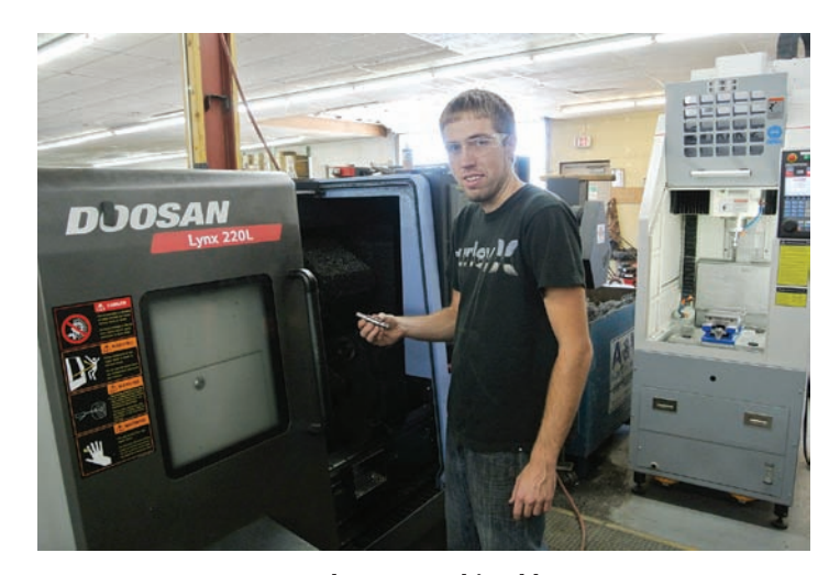
Sample part machined by a TRAK 2OP and Doosan Turning Center.

Keeping machined part work-in-process inventory levels under control is a challenge that many job shops face. Damark Manufacturing produces a large variety of low volume parts. Organizationally, the company groups similar machines together to perform batch processing - turning centers and lathes in one area and machining centers and mills in another. Over time, Damark Manufacturing observed that its work-in-process inventory levels were rising to unacceptably high levels due in large part to time consuming VMC changeovers. The company needed a solution.